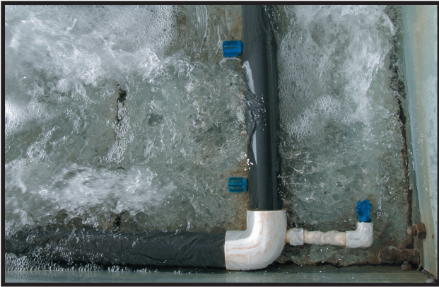
HydroBoosters in action

Results: With the patented HydroBooster nozzles pushing solids and debris to the inlet of the separator, the cooling tower basin now stays free of unwanted solids. The solids enter the separator where they are filtered out and conveniently emptied into the recovery vessel for easy clean up.