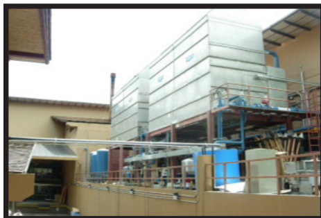
The hotel's cooling towers are only 50 feet away from the beach, making solids-free water a top concern

Problem: The Four Seasons Hotel and Resort at Peninsula Papagayo in Costa Rica is a tropical getaway. Situated perfectly in the middle of lush foliage and relaxing beaches, guests of the resort are surrounded by beauty and luxury. The customer experience is the number one priority.