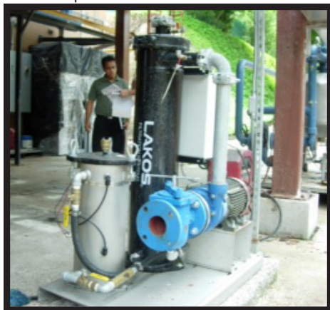
The resort's new LAKOS TCX-100-SRV during installation

With the hotel's cooling towers and mechanical room only 50 feet from the beach, keeping solids out is a high priority for this exotic ocean side resort. So when their chiller's condenser and cooling tower's basin filled with sand, pieces of plastic, wood sticks and other debris, the 5 star resort acted quickly.