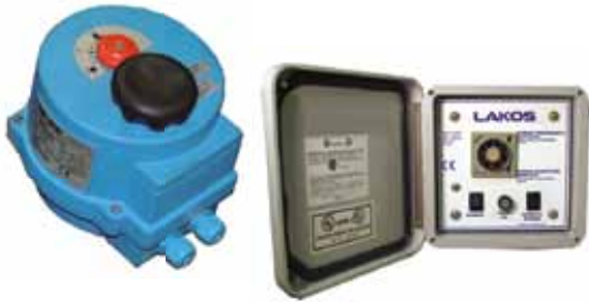
EFS Valve shown with purge controller