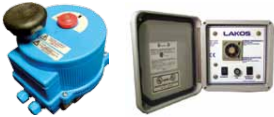
ABV2 shown with purge controller