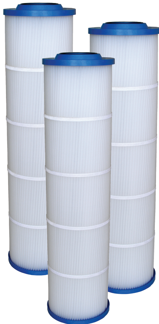
Performance Plus Poly-Mesh Cartridges