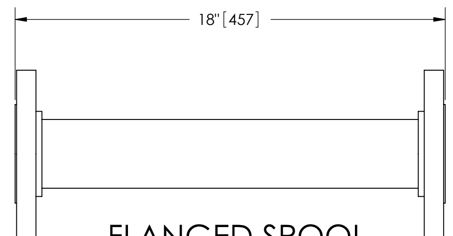
FLANGED SPOOL MODEL FS-025 (AVAILABLE SEPARATELY) REQUIRED FOR REMOVAL OF TOP ASSEMBLY