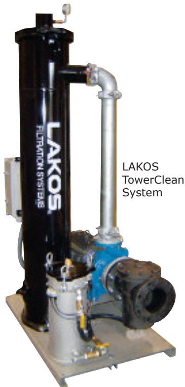
LAKOS TowerClean System

Calculate your potential savings. Contact us for a No-Obligation Tower Inspection and application analysis. Take advantage of this opportunity to reduce your operating costs. We sincerely welcome your call.