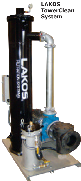
LAKOS TowerClean System

Calculate your potential savings. Contact us for a No-Obligation Tower Inspection and application analysis. Take advantage of this opportunity to reduce your operating costs. We sincerely welcome your call.