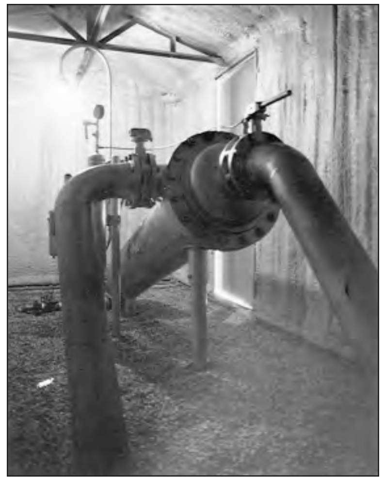
Protected from harsh environmental elements, these Lakos "lowprofile" Separators are easily enclosed in small insulated sheds or below-ground cellars.

AMOCO PRODUCTION Co.; Levelland, TX TEXACO; Quito, Ecuador AMINOIL; Monahans, TX ELK HILL NAVAL RESERVE; Bakersfield, CA