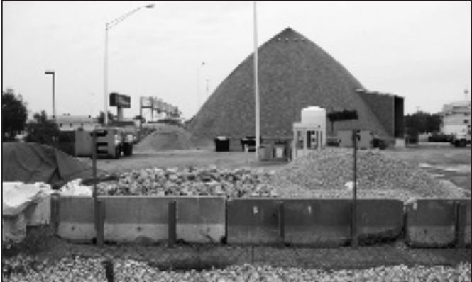
Above: dirt, roadway and building materials from the Dept. of Transportation maintenance yard get into the chillers next door at the Hilton Garden Inn Chicago O'Hare. At Right: Fine mesh screens were affixed to air inlet faces of the Hilton Garden Inn cooling tower in an early, unsuccessful effort to prevent airborne particulate contaminant from entering the tower. Below: System layout.

Solution: The improperly installed side-stream system was removed and a full-stream LAKOS HTH-0810 was installed with a Solids Recovery Vessel (SRV). The SRV contains a 25 micron filter bag, which needs to be emptied weekly due to the amount of solids collected. The Hilton Garden Inn management and facilities engineer reported the high head pressure problems have been eliminated, thus enabling the HVAC system to maintain design temperatures and properly cool and warm the facility. Hotel management says they are pleased to finally have resolved the problems that were affecting the HVAC system and the new LAKOS Separator has assisted greatly in resolving guest complaints regarding comfort cooling issues.