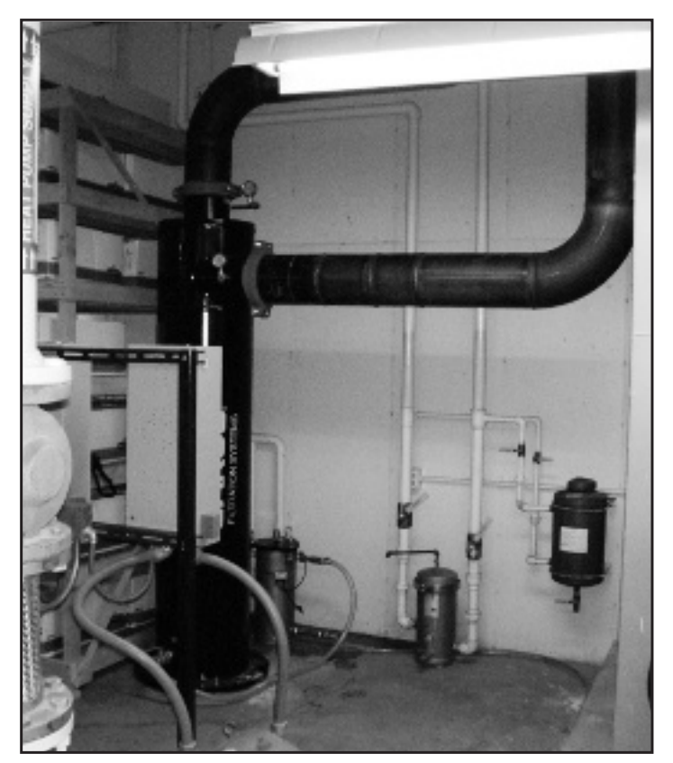
LAKOS HTH-0810 Separator installed full-stream with a Solids Recovery Vessel.

A side-stream separator filtering less than 10 percent of the system flow was initially installed along with the Multistack chillers, but three years later it was retrofitted incorrectly. The result was a decrease in performance. This accumulation of solids led to a drop in chiller efficiency and made it harder to cool the rooms in the summer.