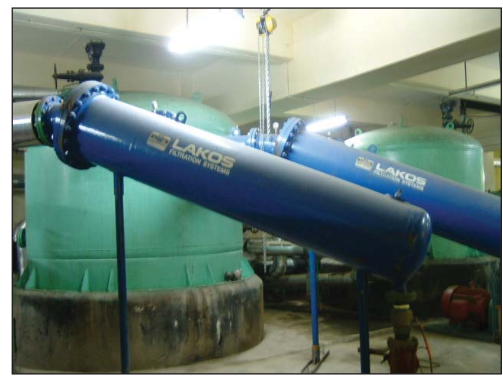
Two RFD/RAX-1202-B Separators in series

Solution: In November, 2000, six pairs of Bi-Sep Separators (ASME coded, Model RFD/RAX-1202-B)