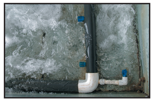
HydroBoosters in action

Results: With the patented HydroBooster nozzles pushing solids and debris to the inlet of the separator, the cooling tower basin now stays free of unwanted solids. The solids enter the separator where they are filtered out and conveniently emptied into the recovery vessel for easy clean up.