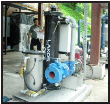
The resort's new LAKOS TCX-100-SRV during installation

solids out is a high priority for this exotic ocean side resort. So when their chiller's condenser and cooling tower's basin filled with sand, pieces of plastic, wood sticks and other debris, the 5 star resort acted quickly.