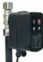
AutoPurge with motorized ball valve