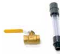
Manual & Visual Purge Options