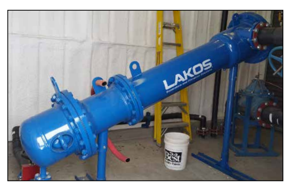
JPX-0650-L/FLG/EC/NS separator was designed specifically for this application.

Because zebra mussels will attach to hard surfaces like metal and collect in areas of low velocity, LAKOS recommended the plant run