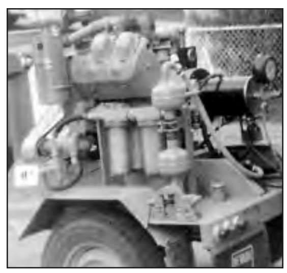
The compact Lakos Separator (see photo) was easily retrofit on Miller's portable hydroblaster system as a pre-filter to the cartridges (see illustration).

"We get everything from very good tap water to muddy, rusty water from a tank truck," says Joe Miller, owner/operator of Miller Enterprises-Hydroblasting. "The Lakos Separator has saved us 50% in overall cartridge costs and downtime."