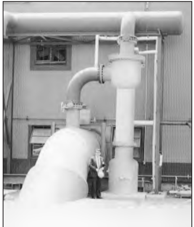
The LAX Series Separator installed on this huge turbine pump protects the main condenser by removing scale and corrosive particles from cooling tower water.