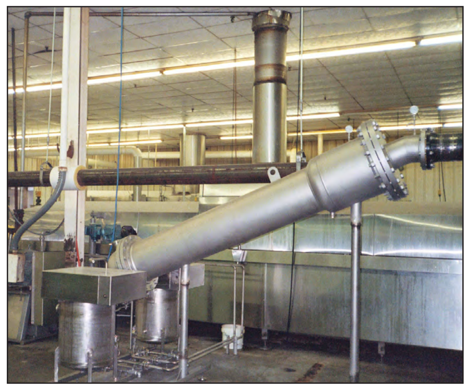
Top left: Purge System showing solids collection vessels and valves

At right: LAKOS CSX-1450HL-S4 FrySafe System Above: Baskets inside the solids collection vessel