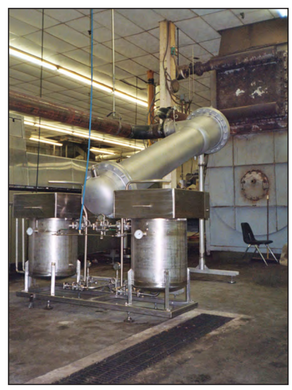
FrySafe System showing purge and heat exchanger in the background.

Problem: Backer's Chips plant in Fulton, Missouri has two large fry lines to cook potato chips. One fryer has a shell and tube heat exchanger that had clogging problems with the build-up of solids in the tubes. This would stop the flow of oil through the tubes and melt the tubes. Oil would then spray out of the heat exchanger and catch on fire-creating a serious hazard. LAKOS was contacted to find a solution that would safely and easily remove solids from the hot cooking oil.