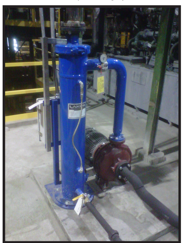
The installed LAKOS JCX-0225 has saved the plant money, time, and water while improving product quality.

Problem: A large manufacturer of rolled metals in Kentucky produces finished metals for everything from automobiles to military defense projects. With that kind of responsibility on the line, product quality is