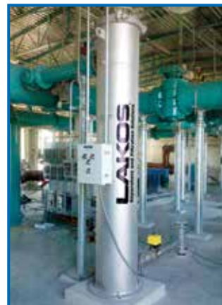
JPX-1160-V/Stainless Steel with AutoPurge in Ethanol Plant

For more information on LAKOS JPX Separators, please refer to literature LS-632.