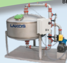
STS- Sand Media Tank System