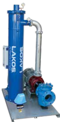
JCX Filtration Systems

LAKOS also offers packaged solutions for cooling tower basin cleaning or side stream filtration for greater efficiencies. Plant efficiency equals increased productivity, and energy savings. Using non-barrier, non-strainer centrifugal filtration, LAKOS Separators can help maximize production at a minimal cost, providing a consistent level of filtration with little or no maintenance. This saves time, energy and money for ethanol plants.